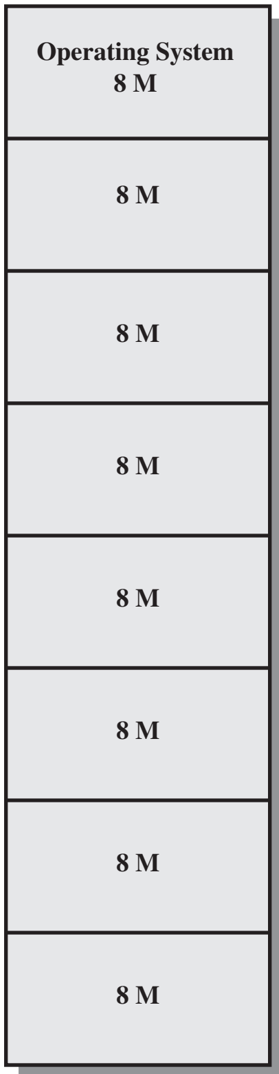
(a) Equal-size partitions